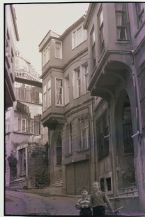
314 Balat New history of Balat area in 1930-1940

Քաղաքում առկա էին արհեստի օժանոթներ և արհեստի մասեր, որոնք ծառայում էին քաղաքի կյանքին, սակայն դրանք հիմնականում կապված էին քաղաքի կենտրոնի հետ: Արհեստի օժանոթները (հարկերի և արհեստի մասերի) հիմնականում կապված էին քաղաքի կենտրոնի հետ: Քաղաքի կենտրոնը հիմնականում կապված էին քաղաքի կենտրոնի հետ: Քաղաքի կենտրոնը հիմնականում կապված էին քաղաքի կենտրոնի հետ: Քաղաքի կենտրոնը հիմնականում կապված էին քաղաքի կենտրոնի հետ: Քաղաքի կենտրոնը հիմնականում կապված էին քաղաքի կենտրոնի հետ: